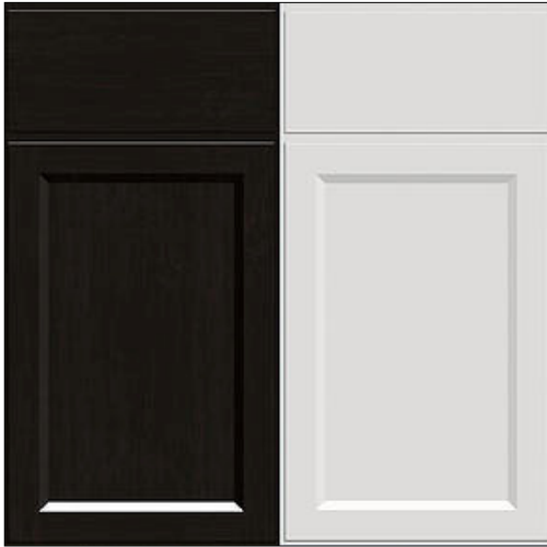
Providence Espresso/Providence White