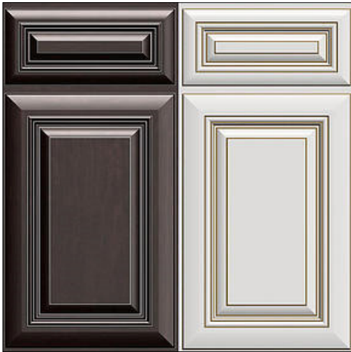
Calumet Mocha with Platinum Glaze/ Calumet Ivory with Caramel Glaze