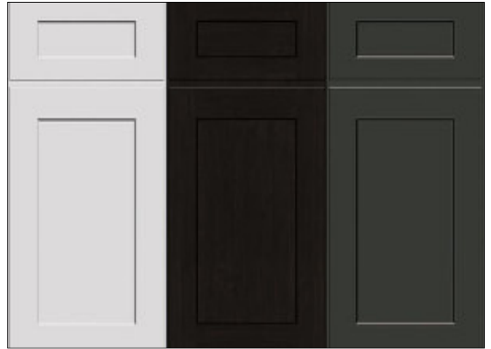
Liberty Shaker White/Liberty Shaker Espresso/Liberty Shaker Gray