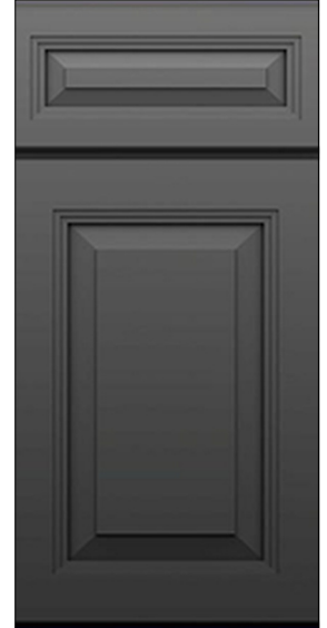
Belmont Gibraltar Gray