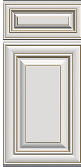
Arlington Oatmeal with Caramel Glaze