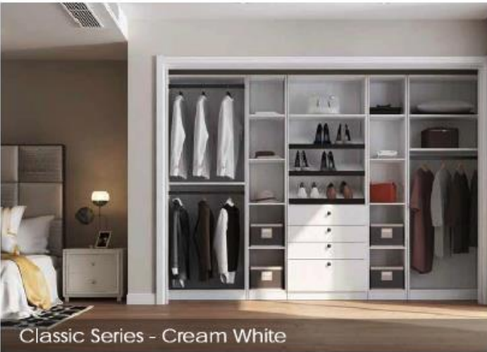
Classic Series - Cream White