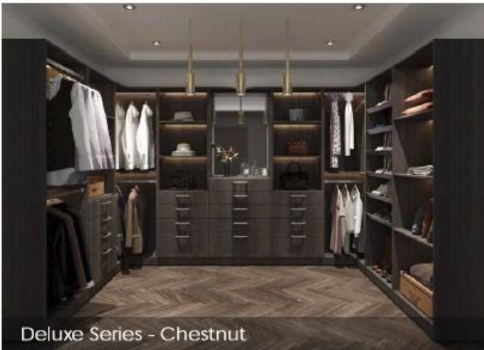
Deluxe Series - Chestnut

Scant 3/4" thick MFC board, with melamine laminate on both front and back, and matching color edge banding on all edges,