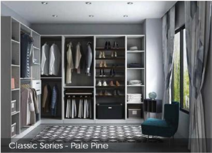
Classic Series - Pale Pine