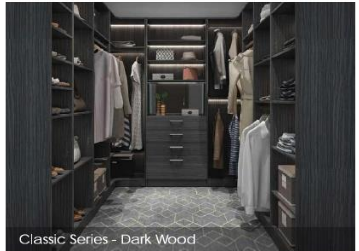
Classic Series - Dark Wood