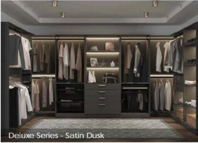
Deluxe Series - Satin Dusk

Scant 3/4" thick MFC board, with melamine laminate on both front and back, and matching color edge banding on all edges,