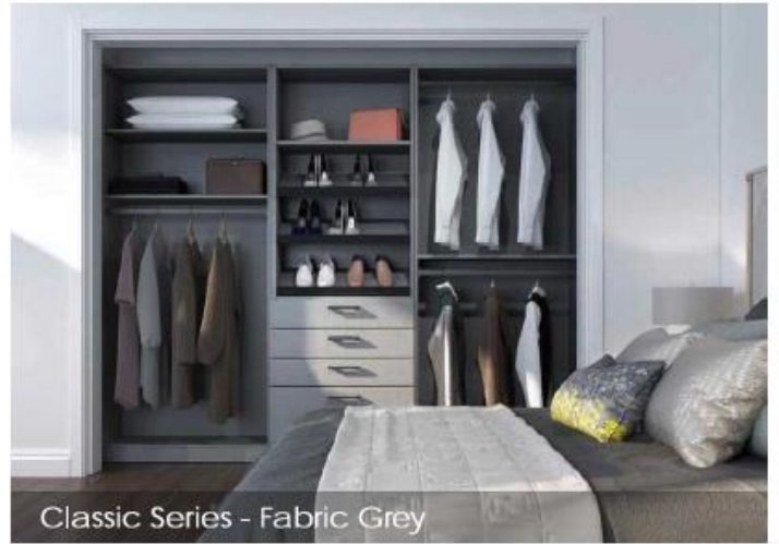
Classic Series - Fabric Grey