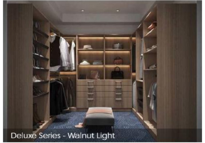
Deluxe Series - Walnut Light

Scant 3/4" thick MFC board, with melamine laminate on both front and back, and matching color edge banding on all edges,